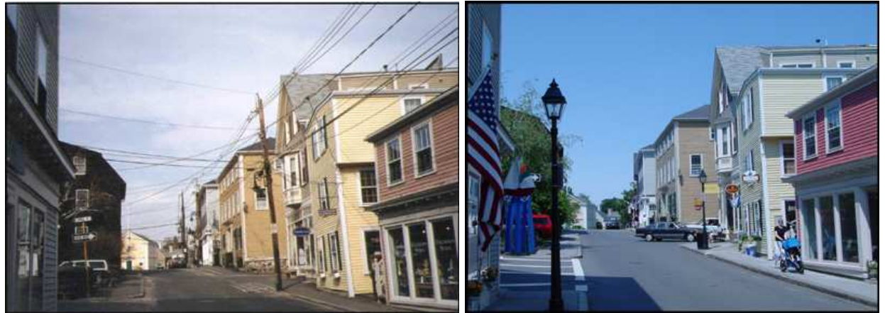
before Marblehead Muni after