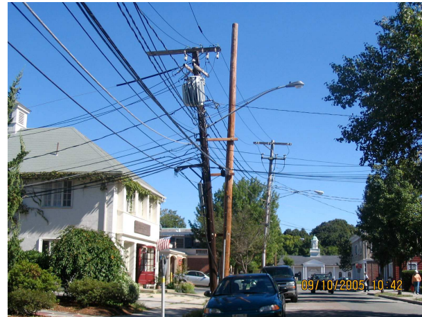
Lexington, NStar Double pole on Muzzey St since 2005