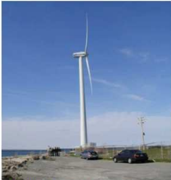
The Hull Muni generates wind power

A muni can develop or purchase “green” power